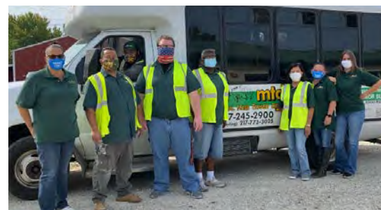
(CENSUS PARTNERS IN JACKSONVILLE, IL) WEST CENTRAL MASS TRANSIT